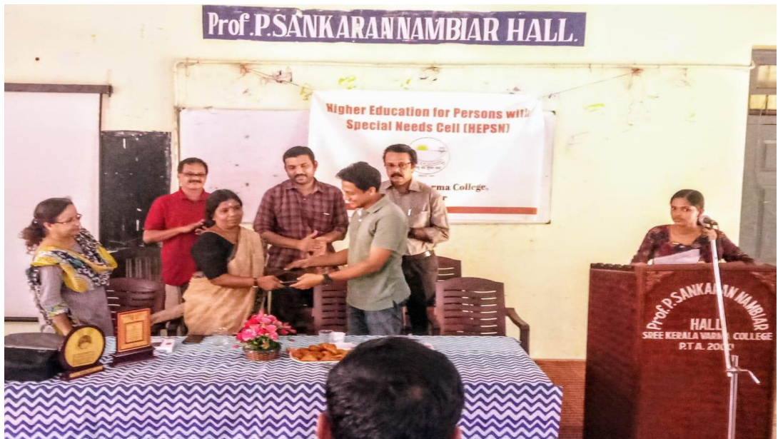
Received Award Laptop from the Sponsoring Agency