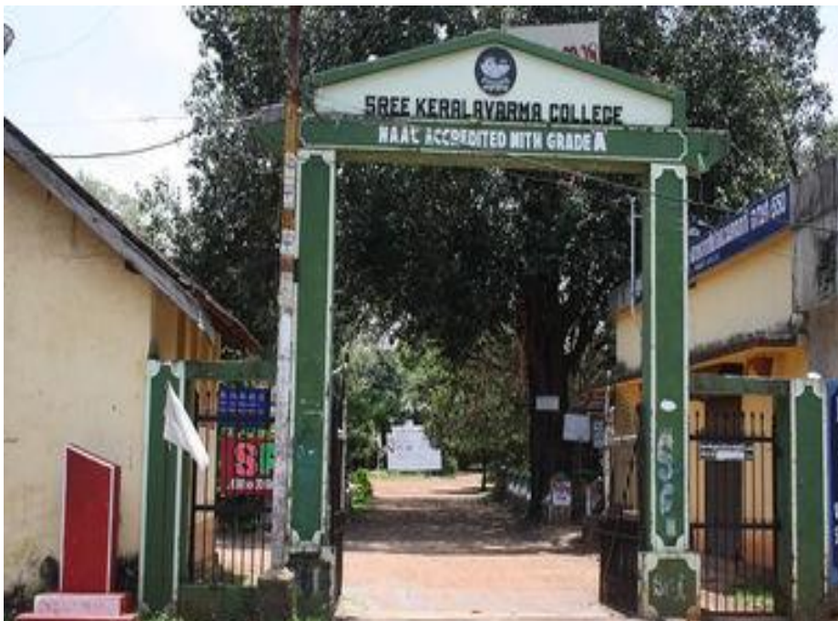
Photograph 1 & 2 Sree Kerla Varma College, Thrissur