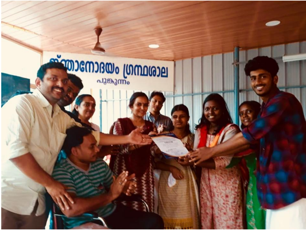
Award Winning Photo